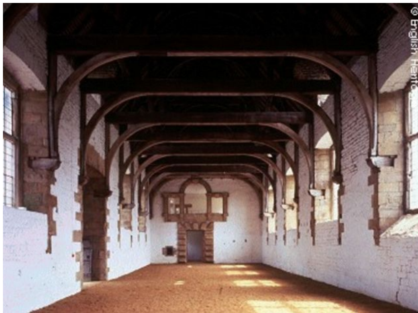
Figure 3: Newcastle's riding school at Bolsover.

William and his father both inherited Bess of Hardwick's interest in buildings. They bought Bolsover Castle (now an English Heritage property), which had previously been granted to George Earl of Shrewsbury and Bess, with a view to major construction work. They destroyed most of the castle that had stood on the site since the twelfth century and began building a new manor house. William continued the building work after his father died. The riding school, measuring 92' x 30', was completed sometime in the period 1630 to 1634. It still stands today (see figure 3), having recently been refurbished, and remains one of the earliest surviving indoor riding schools.