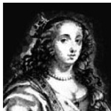
Figure 4: Margaret Cavendish

William and Margaret (figure 4) quickly fell in love. They exchanged many letters during their courtship – these have survived and they were published in book form in the 20 th century. The couple