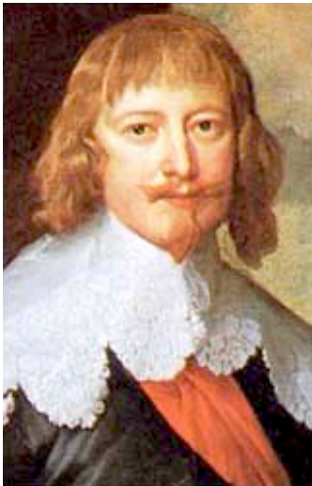
Figure 1: William Cavendish, Earl, Marquis and Duke of Newcastle

The Duke of Newcastle (figure 1) was an equestrian pioneer who developed a new method of training horses and wrote two important books on the subject. He lived in the period between the early Italian masters who re-discovered the art of riding that had been practised by the ancient Greeks, and the 18 th century French riding master La Guérinière who is held in great esteem today. La Guérinière's training ideas have survived centuries and form the basis of what we now call "classical riding". It was he who invented the "shoulder-in", but it was one of Newcastle's exercises, a kind of shoulder-in ridden on a circular track, that gave him the idea. In his book, La Guérinière quotes Newcastle's advice on how the rider should be seated on the horse, and it is clear that Newcastle's work played an important part in the development of the art of riding.