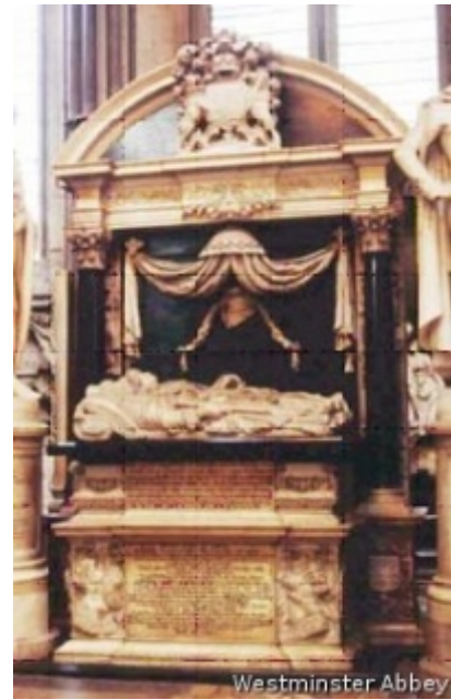
Figure 6: The William & Margaret Cavendish monument in Westminster Abbey

The noble couple left their mark on the world and we are richer because of their lives. They would be delighted to know that we are still reading their books and the story of their lives more than three hundred years on.